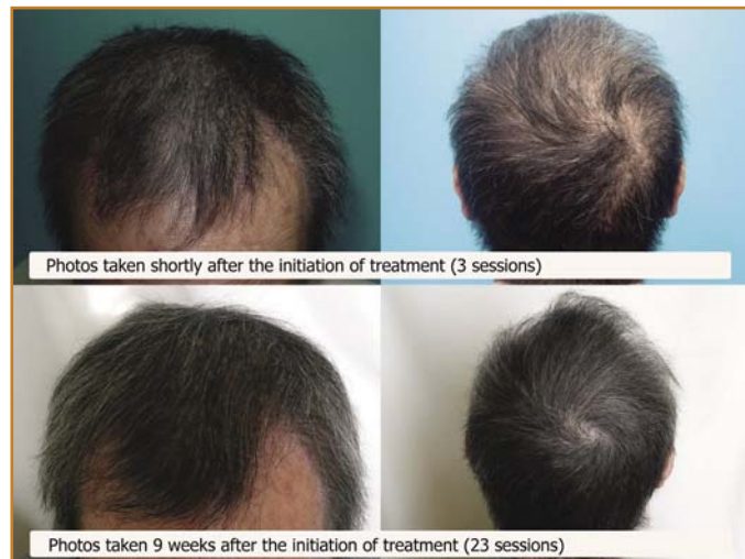
Figure 2. Pictures in the top row were taken 10 days (3 treatment sessions) after initiation of LaserCap therapy. Note the significant hair loss in these pictures. Pictures in the bottom row were taken about 9 weeks (23 treatment sessions) after initiation of LaserCap therapy. Not only did the patient's hair loss stop, his hair also grew back while he was under active chemotherapy (note the skin eruption on left forehead due to cetuximab).

Hoping to stop the patient's hair loss, in April 2010 Drs. Tseng-Kuo and I-Sen Shiao had started the patient on LaserCap treatment. LaserCap is a portable low level laser therapy device containing 224-650nm 5mw laser diodes. The patient received 30-minute LaserCap treatments 2-3 times a week. By June 2010, after 23 sessions (about 9 weeks of LaserCap therapy), the patient's hair loss had completely stopped. He had also regained his lost hair and may have had a higher hair density than he did prior to chemotherapy (Figure 2). The patient did not use minoxidil, because it irritated his already compromised skin (from cetuximab).